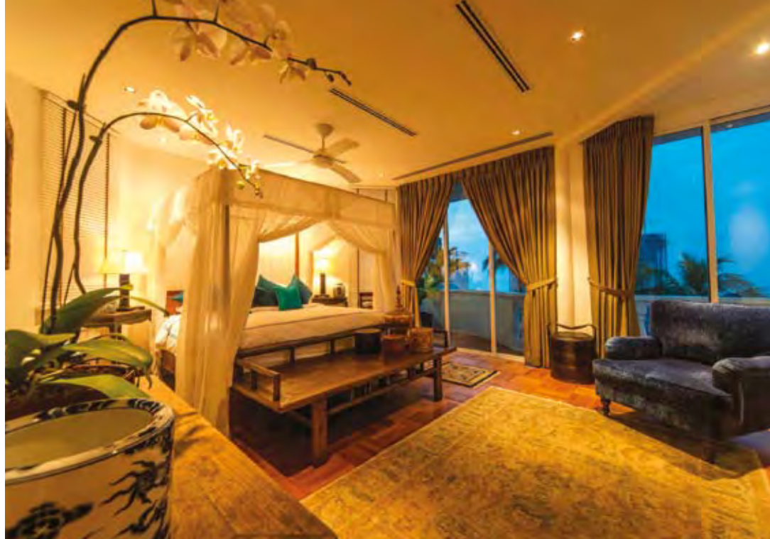
TOP: Guest bedroom at the entrance level with poster bed; BELOW: spiral staircase going down to the lower ground floor