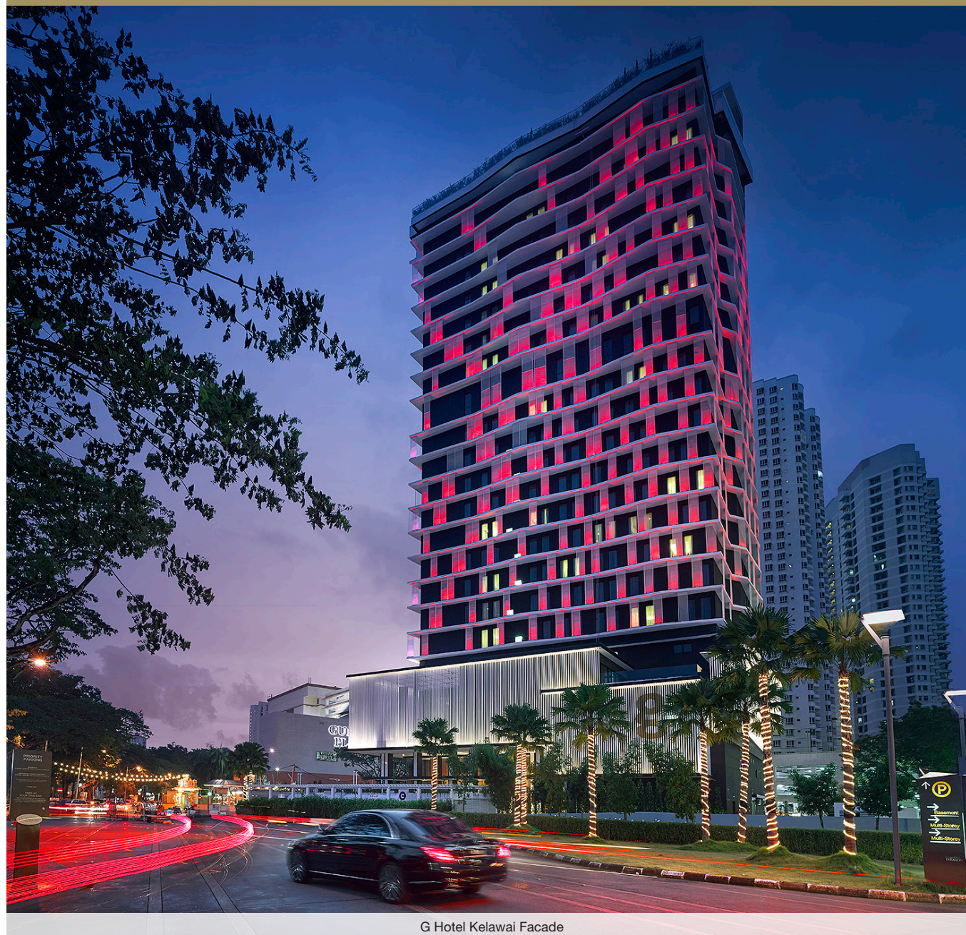
G Hotel Kelawai Facade

Sleek and chic yet cosy with intimate touches, the lobby is all about style redefined. Upon entering the main lobby, one is greeted with triple volume space above the main staircase that extends the visual and spatial continuity to the upper levels. Step right into designer furnishing with Italian made Baxter Chester Moon Sofa and Baxter Molly Armchair, feel right at home but yet in worlds apart.