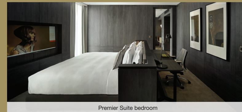
Premier Suite bedroom

Every room comes with Serta Royal Platinum Mattresses, Herman Miller designer work chairs, 55 inch smart HD LED TV, Appelles eco-friendly toiletries, 300 thread count linens, alarm clock, ironing facilities, free non-alcoholic minibar and 150Mbps high speed WIFI in all rooms and throughout the hotel.